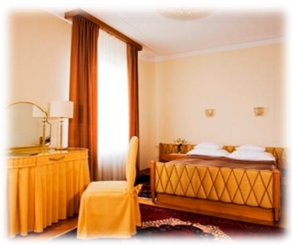
HOTEL RIBNO BLED ****

The Vila Bled is in an idyllically peaceful part of Bled, the jewel in the crown of the lovely Slovenian Alps. It reigns directly on the shores of Lake Bled, embraced by a magnificent park. This former presidential residence is nowadays a synonym for warm hospitality, selected comfort, timeless elegance, top-end gastronomy and unforgettable experiences. We